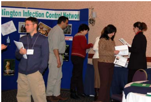
At the ARO Workshop : Participants at the resource table