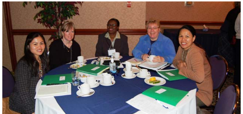
At the ARO Workshop : Participants enjoying the day