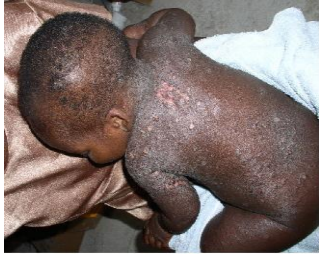
A baby infected with scabies