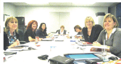
The 2009-2010 CIC study group members are hard at work and plan to write their CIC in the spring. Happy Studying!