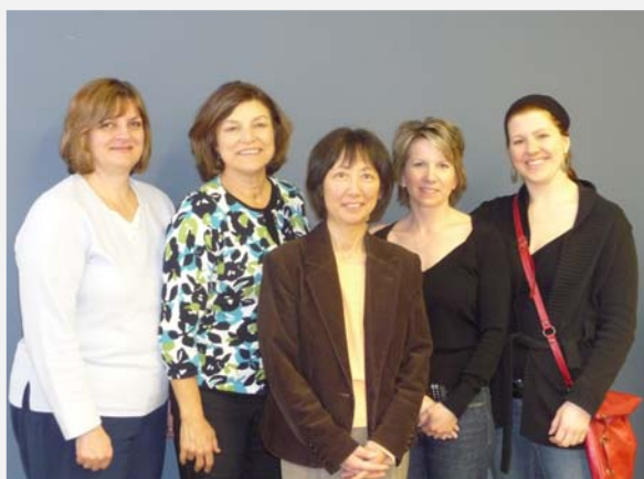
CSICN JCYH Coaches

Contact CSICN for participation information.